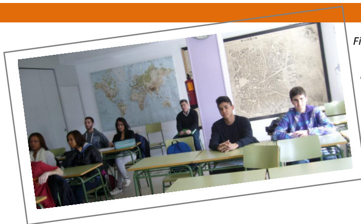
Fig. 3-5. Testing Learner Training Programme in Spain, March 2015

The training will last four weeks. 11 students of Vocational Training - Computing Microsystems and Networks and Office Administration- will participate, as candidates, in the MOBILE Training,