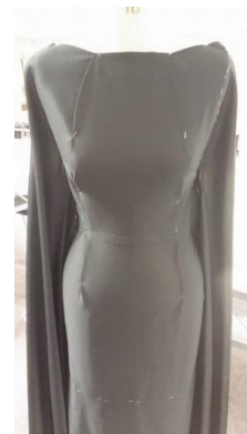
Fig 13-15. As above

Post-mobility it will be interesting to evaluate and find out what was good and relevant in the learner program and what we need to develop further.