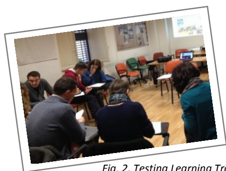
Fig. 2. Testing Learning Training Programme in Palermo, 12 February 2015

Training materials are available in the following languages: English, German, Polish, Spanish, Swedish and Italian. You can download them for free from: www.mobilityinlearning.eu