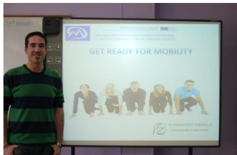
MOBILE Learners Training Seminar began on March 4 th in TOMILLO FOUNDATION.