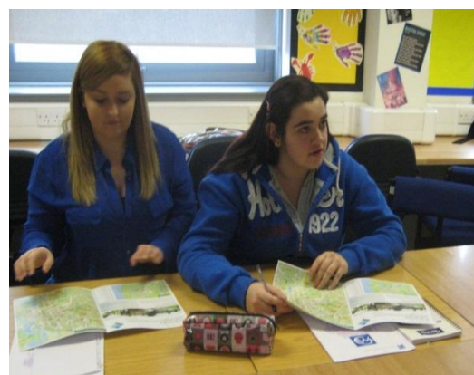
Fig. 6-7. Exchange between Sweden and the UK, March 2015

The students specialised in a variety of vocational subjects such as: car repair, construction, beauty therapy, hairdressing, fashion, childcare, and hospitality. Students from Linköping worked in a range of placements, both within local enterprises and within Doncaster College's commercial facilities.