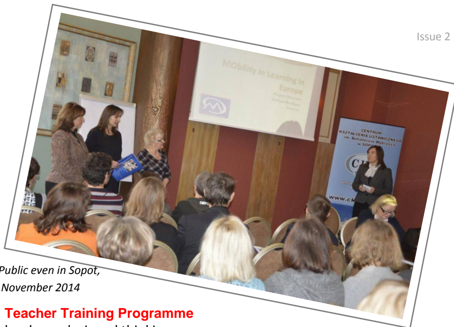
Fig.1. Public even in Sopot, 28 November 2014

MOBILE Training Programmes are important tools offered by MOBILE for a successful mobility.