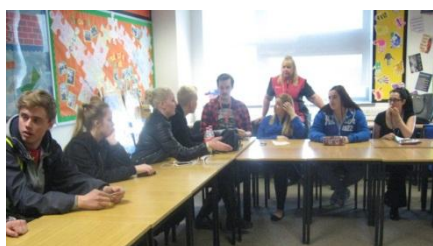
Fig. 8. Exchange between Sweden and the UK, March 2015

During their stay in Doncaster, the Swedish students met up with Doncaster College students studying childcare and animal care, who will be going to Linköping for a 2-week work placement mobility in April. The students shared Swedish language and cultural tips with the UK learners and what they could expect when they come to Linköping. This meeting was a fantastic experience, especially for the Doncaster College students, as it gave them a taste of the language and helped them make connections with Swedish peers even before departure. Gaining a bit of background to the culture, language, and city pre-departure has certainly eased some initial fears and also increased the students' excitement and enthusiasm about the trip!