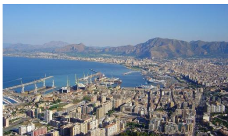
Fig. 16. Palermo; taken from http://pl.wikipedia.org/wiki/Palermo